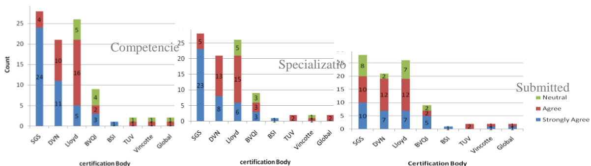
Figure 2: Satisfaction level of competencies, specialization, and submitted reports to external auditors of certification bodies