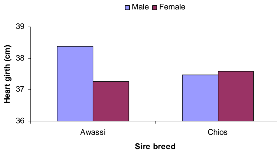
Figure 1. Interaction effect of sire breed and sex on heart girth, shoulder and hip width for lambs at birth.

ns (P>0.05), * (P < 0.05), ** (P < 0.01), *** (P < 0.001). a,b means with different superscripts are different (P < 0.05).