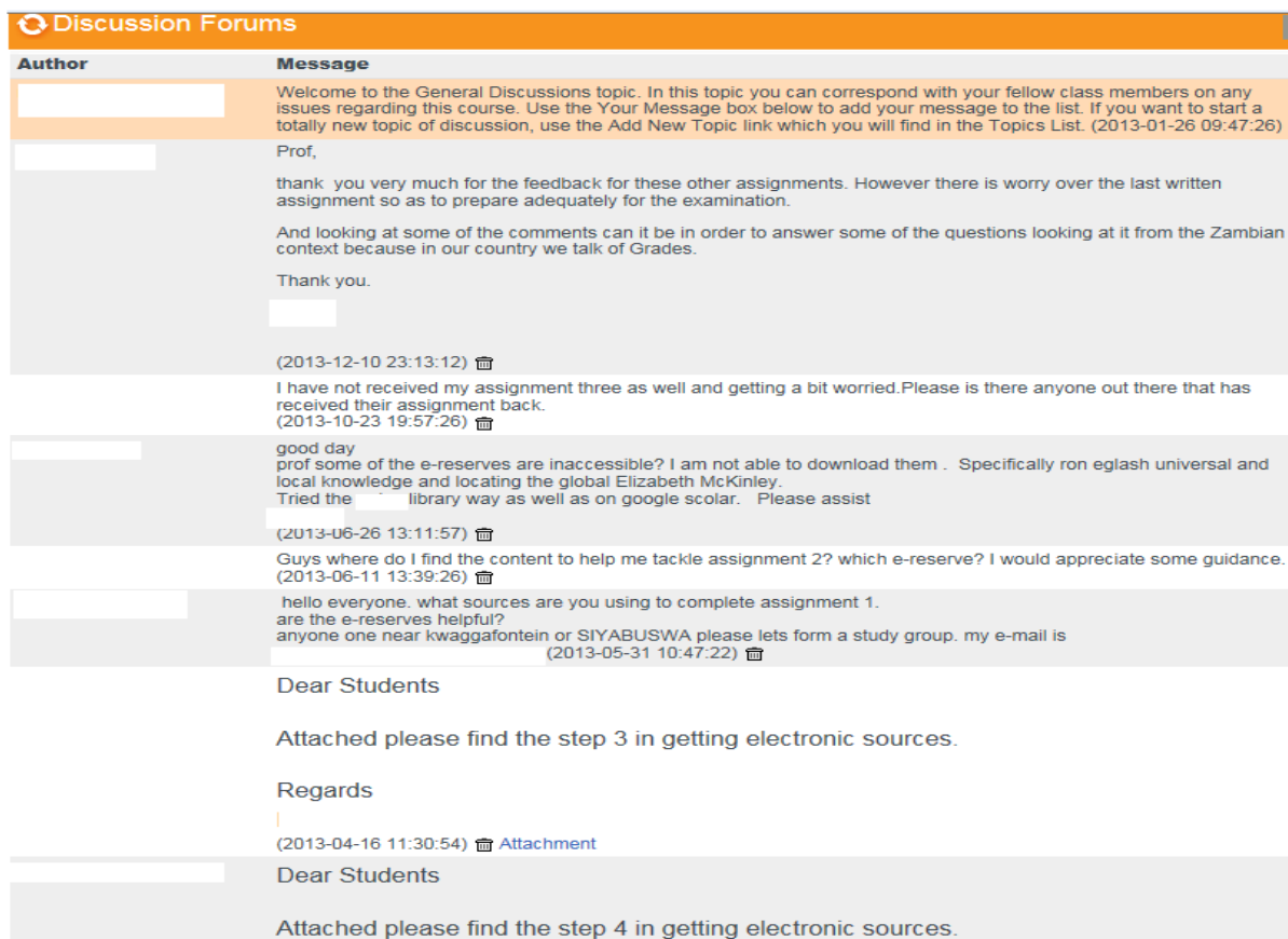
Figure 4 Some Topics posted on the discussion forum in 2013

Many of the issues raised on the discussion forum (Figure 4) show that the students are frustrated and lonely. For example, one of the students writes: “Guys where do I find the content to tackle the assignments” . However, comments like this one: “I have not received assignment three” , should not have been written on the discussion forum, instead the query should have been sent directly to the lecturer. The comments written by students clearly show that they did not know what was appropriate for the discussion forum.