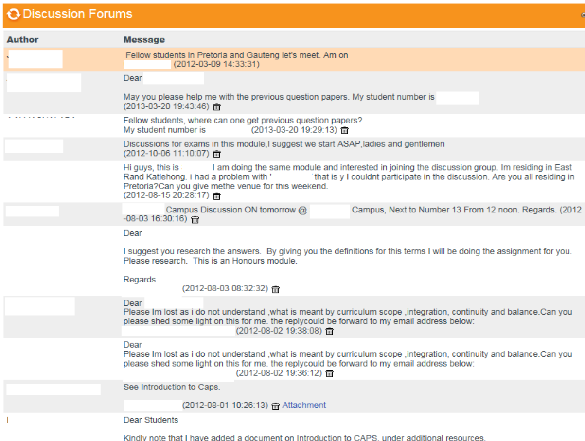
Figure 2 Print screen discussion forums